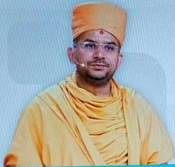
PUJYA APURVAMUNI SWAMI