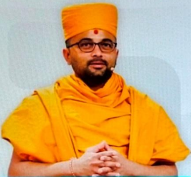
PUJYA GNANVIJAY SWAMI