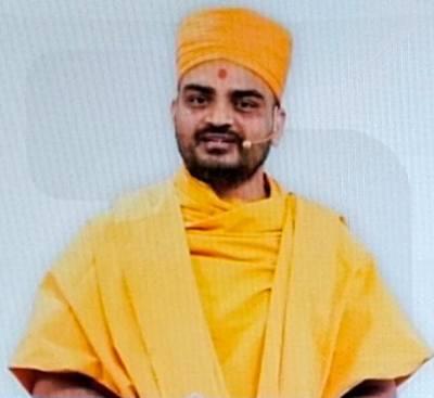
PUJYA GNANNAYAN SWAMI