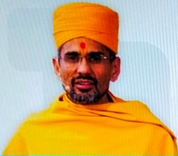
PUJYA ATMATRUPT SWAMI