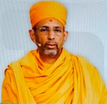
PUJYA VIVEKJIVAN SWAMI